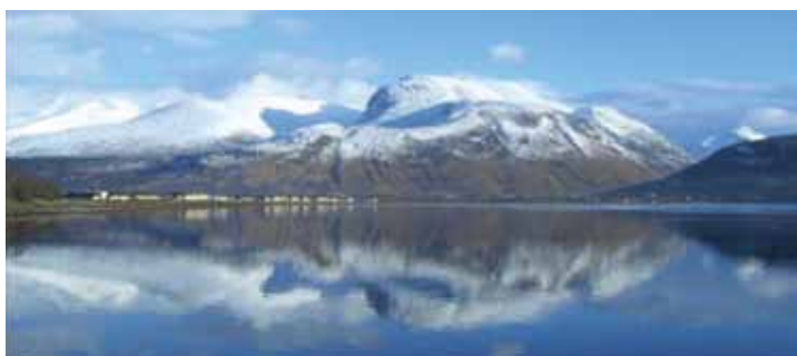
Ben Nevis, Scottish Highlands